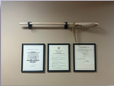
Gifted Lacrosse stick and “Mohawk Warriors” Designation certificate displayed in the 1st Brigade Headquarters