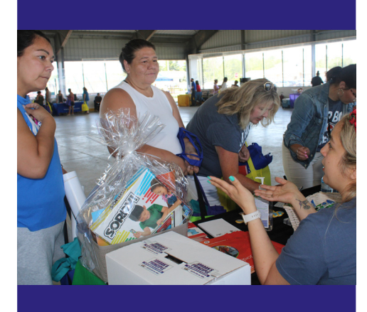
Akwesasne Wellness Week July 17 - 21 Events held throughout Akwesasne