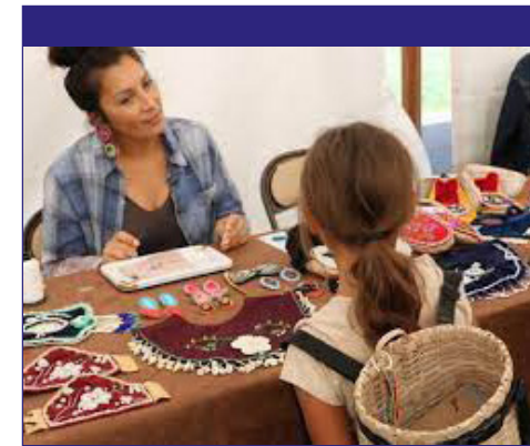
Akwesasne Art Market & Juried Show July 2, 2023 11:00 a.m. - 6:00 p.m. Generations Park