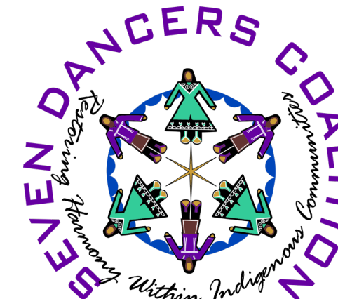
Walk in the Park Last Wednesday of the Month May - September 11:00 a.m. - 2:00 p.m. Generations Park