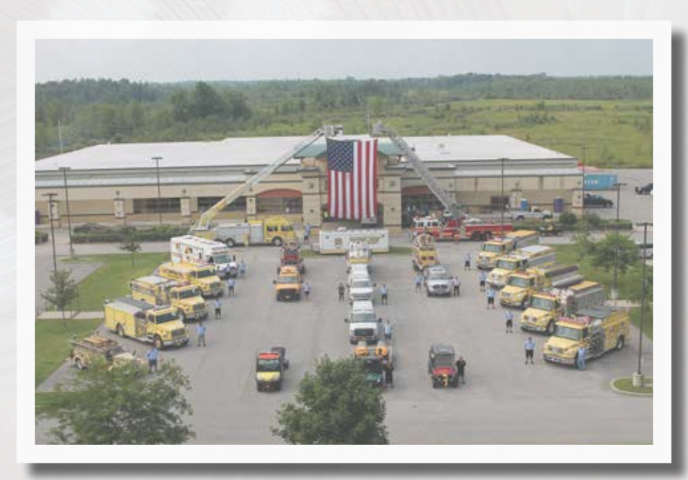
Hogansburg-Akwesasne Volunteer Fire Department 60th Anniversary Celebration.