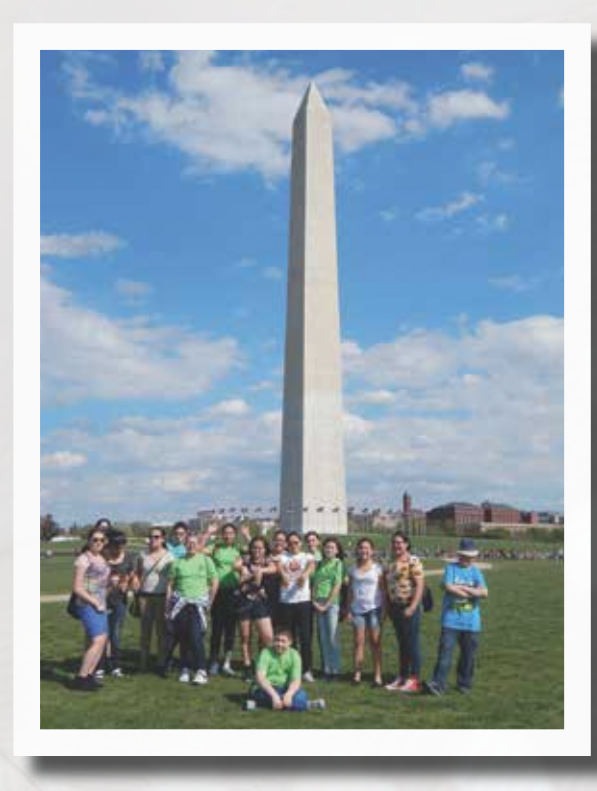
AISES National Conference