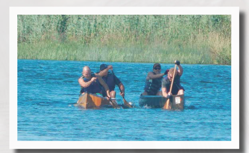
Akwesasne Freedom School Survival Race