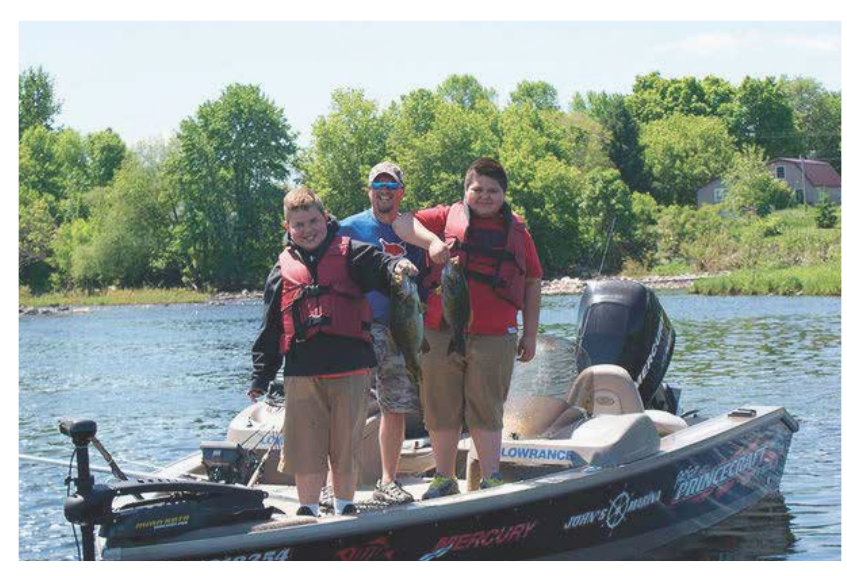
Kids For Fishing