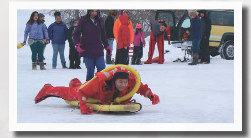
Akwesasne Winter Carnival Obstacle Course