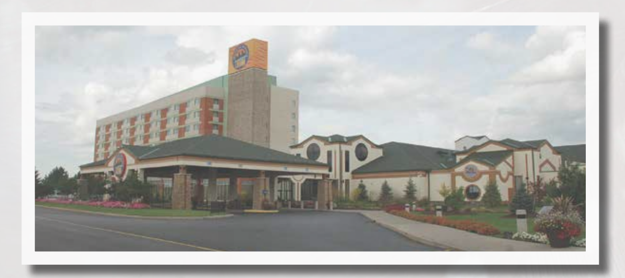
The Akwesasne Mohawk Casino Resort

The quarterly revenue sharing payments amount to 25 percent of slot machine revenues from the Akwesasne Mohawk Casino Resort or the equivalent of $20 million annually. The 2003 Gaming Compact between the Tribe and New York ensures that an eight county exclusivity zone is protected and prevents any competing gaming interests from threatening these benefits to our neighbors.