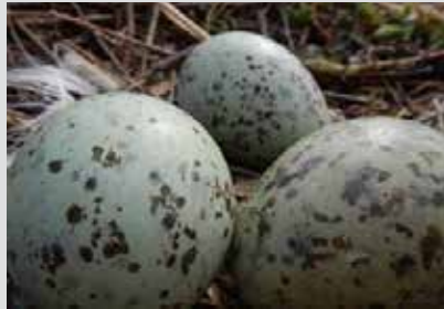
Great Lakes Water Quality Agreement 3/31/2022