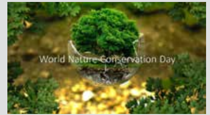
World Nature Conservation Day 7/28/2021