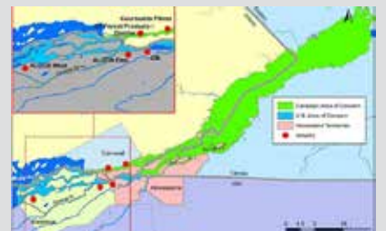
National Indigenous Peoples Day 6/21/2021