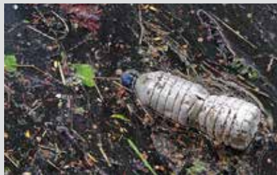
National Recycling Day 11/15/2021