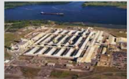
Reynolds Metals 4th - 5 year Report 7/20/2021