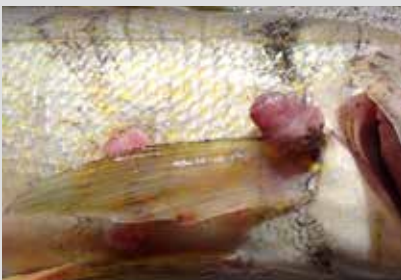
Funky Fish Photos Needed 7/20/2022