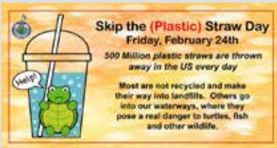
Skip the Plastic Straw Day 02/24/2023