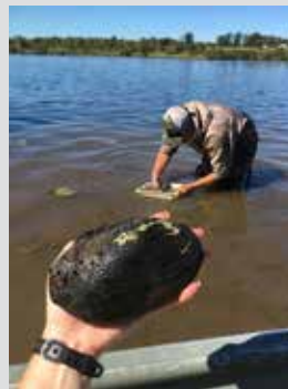
DEC, SRMT Save over 50k Freshwater Mussels in Grasse River 11/4/2021