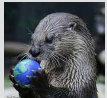
World Otter Day 5/21/2021