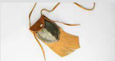
Turtle Pouch Cultural Class 5/20/2022