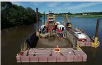
Grasse River Ice Scour Remedy Public Meeting 9/1/2022