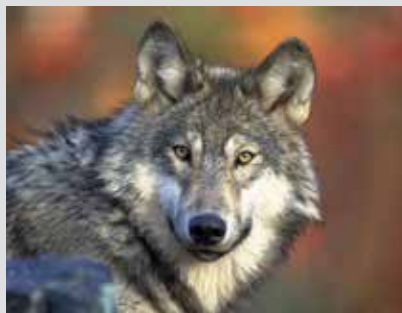
World Wolf Day 8/21/2021