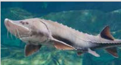
NYSDEC Seeking Comments Great Lakes Action Agenda 10/13/2022