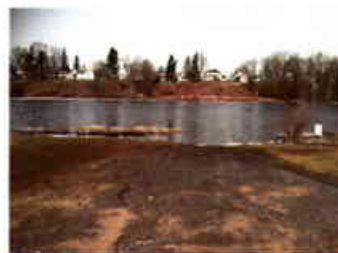
Proposed boat launch and fishing pier site on the upper Grasse River at Madrid.

For more information on the St. Lawrence NRDA, contact: