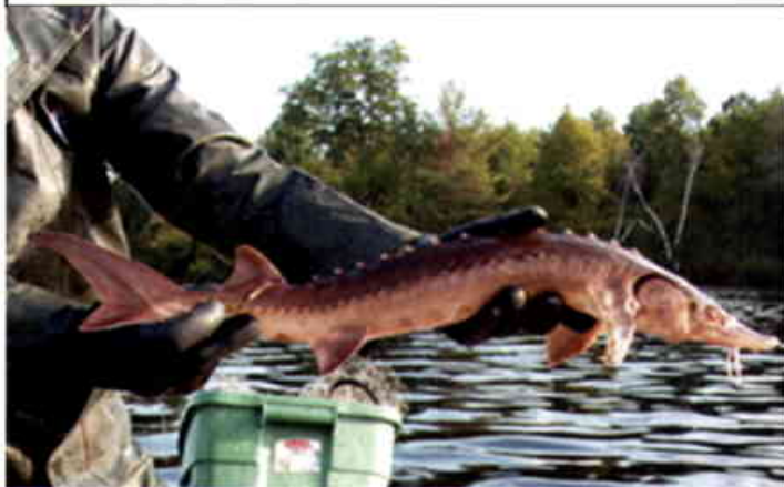
Lake sturgeon stocking and spawning habitat restoration in St. Lawrence River and tributaries: Salmon, Grasse, St. Regis and Raquette Rivers.

Compensation for these impacts will be provided by installing or upgrading five boat launches and fishing piers in the Massena area: Grasse River (Madrid, Rte. 37, Rte. 131) and Raquette River (Massena Springs, Massena).