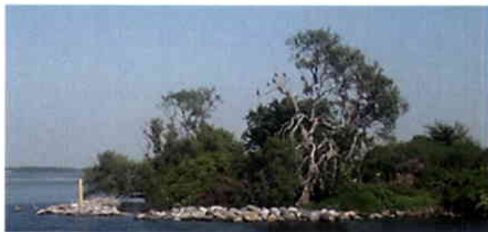
Dickerson Island predator control for Great Blue Heron restoration.